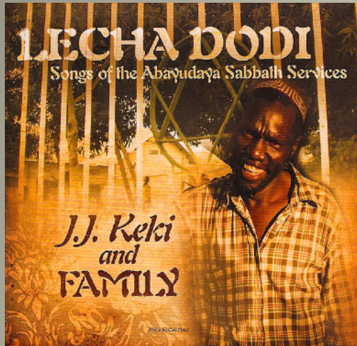
Ugandan Jewish community