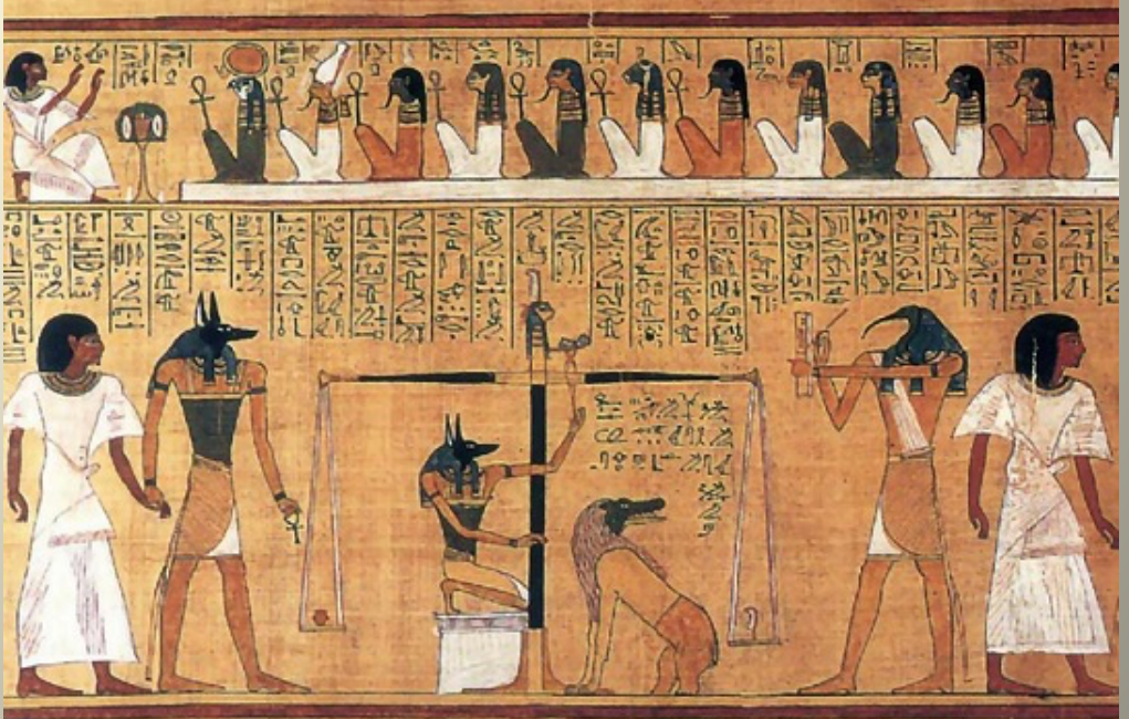
from the Egyptian Book of the Dead